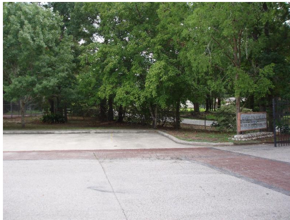
Park Entrance - Before

Here are some photos - before and after!