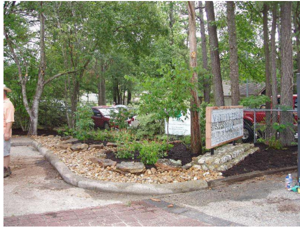
Park Entrance - After